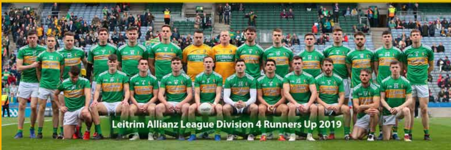
Leitrim Allianz League Division 4 Runners Up 2019