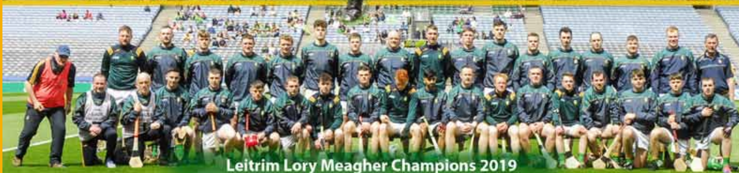
Leitrim Lory Meagher Champions 2019