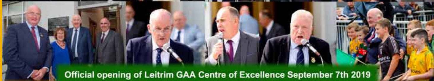
Official opening of Leitrim GAA Centre of Excellence September 7th 2019