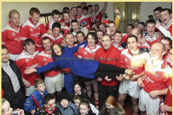
We reached the final of RTE's Celebrity Bainisteoir in 2009 under the stewardship of Katherine Lynch

In 2001 the Junior Championship was won again and the club built on this competing well in the Intermediate Championship and earning promotion to the Senior League in 2009. This was also the year that saw the club take part in the RTE television show Celebrity Bainisteoir under Leitrim comedian Katherine Lynch beating Cuala from Dublin and Rockwell from Tipperary before being pipped at the final hurdle by Glasdrumman from Co Down in a memorable final in Parnell Park. The sense of community generated by this will live long in the memory.